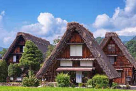
Gassho-style houses in Shirakawa-go village