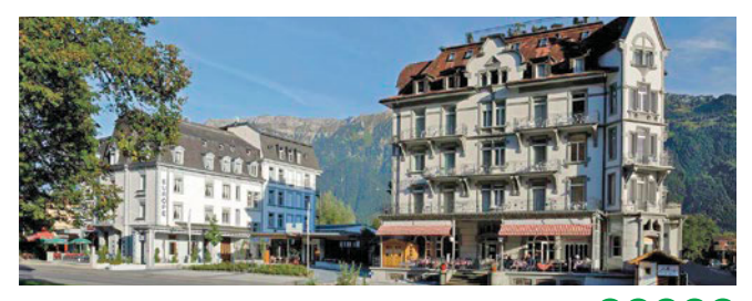
Hotel Carlton-Europe | Interlaken