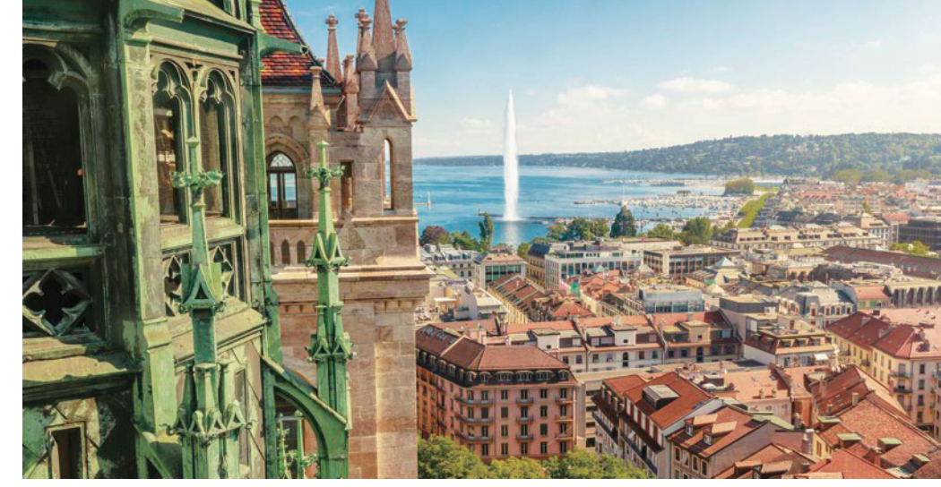
Jet d'Eau, Geneva

AHI Connects | Swiss Cheese. Visit a countryside dairy farm. Watch a demonstration on making handmade Gruyère cheese and sample this decadent product.