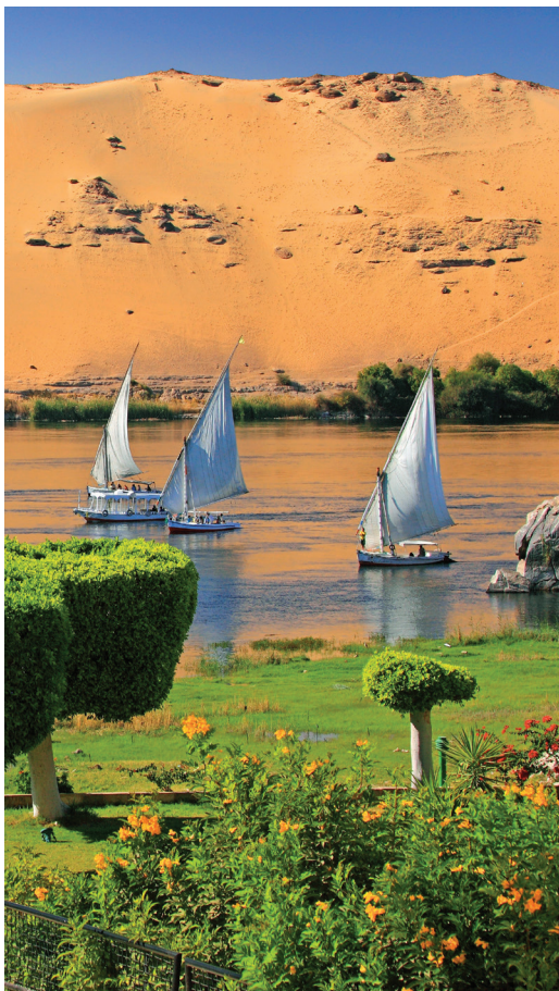
We sail traditional feluccas along the Nile.

Day 15: Depart for U.S. Very early this morning we transfer to the airport for our return flight to the U.S. B