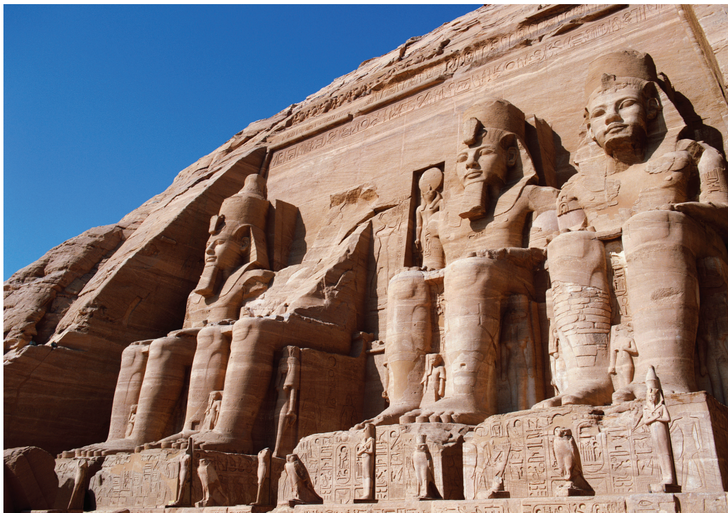
The magnificent temples at Abu Simbel commemorate Ramses II and his queen, Nefertari.

Day 7: Lake Nasser Cruising – Amada/Kasr Ibrim/ Abu Simbel We sail this morning to Kasr Ibrim, the last remaining Nubian settlement in its original location. We learn about this ancient site while overlooking it from the ship's sun deck. Then we continue on to Abu Simbel's massive complex of temples guarded by statues of Ramses II and his wife Nefertari, with well-preserved murals inside. B,L,D