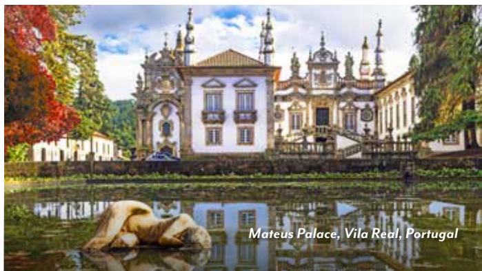
Mateus Palace, Vila Real, Portugal